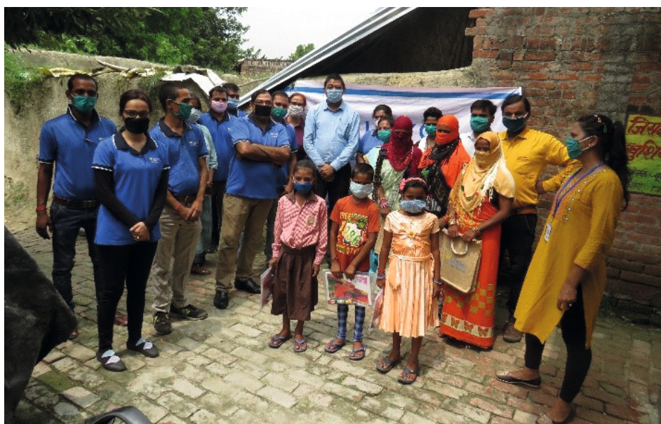
Certificate Distribution at SKG centre

propagated. Some of the parents/guardians were happy to find their children engaged with the programme and sitting with their copy and pencil. Adults were appreciating the information received for the various schemes (Sukanya Smridhi Yojana, Emergency numbers such as 108, 112, School Enrolment Process) run by the Government. This initiative has given an edge to the monotonous routine life of the villagers, especially during the tough time of the pandemic. ■