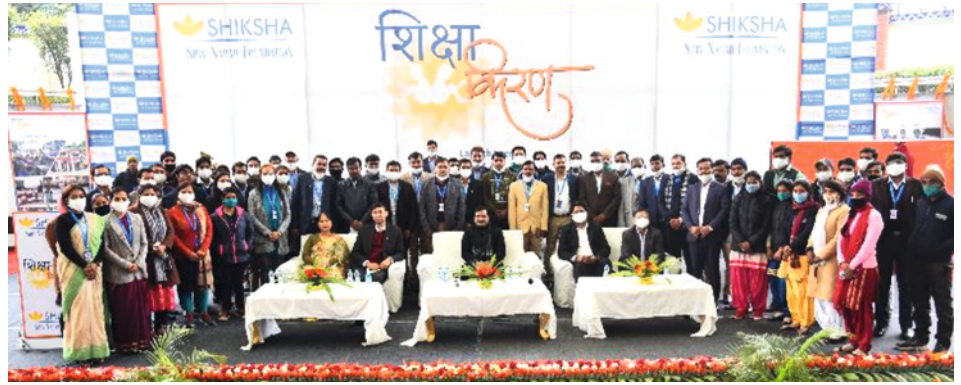
SHIKSHA Team during the launch event of SHIKSHA Kiran