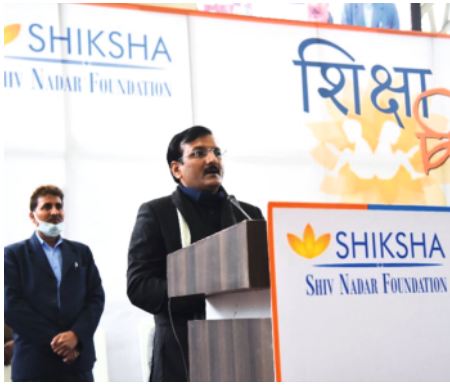
Hon'ble Minister addressing the event at the launch of SHIKSHA Kiran