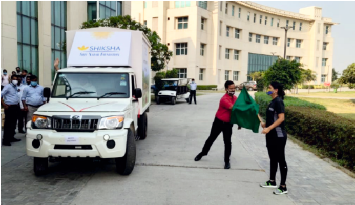
Flag-off of SHIKSHA Kiran from Shiv Nadar University