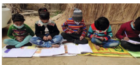
Students learning in SHIKSHA Ki Goonj Class

During Pandemic SHIKSHA Initiative took a leap of faith to stay committed to the goal of providing literacy for inclusive and empowered society. SHIKSHA Initiative launched the program “SHIKSHA Ki Goonj” at Sitapur, Gautam Budh Nagar and Bulandshahr districts of Uttar Pradesh in the months of August and September 2020. This initiative