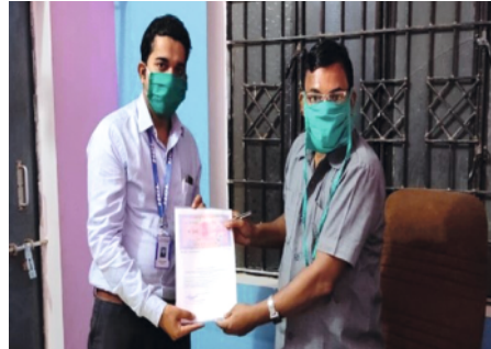
MoU signed with Basic Education Department, Siddharth Nagar

During the meeting, BSA and CDO appreciated SHIKSHA's efforts in being an agent of change and acquainting the schools with ICT Technology. SHIKSHA team explained about the program in detail and a formal MoU was signed for