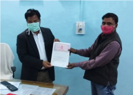
MoU signed with Basic Education Department, Chitrakoot