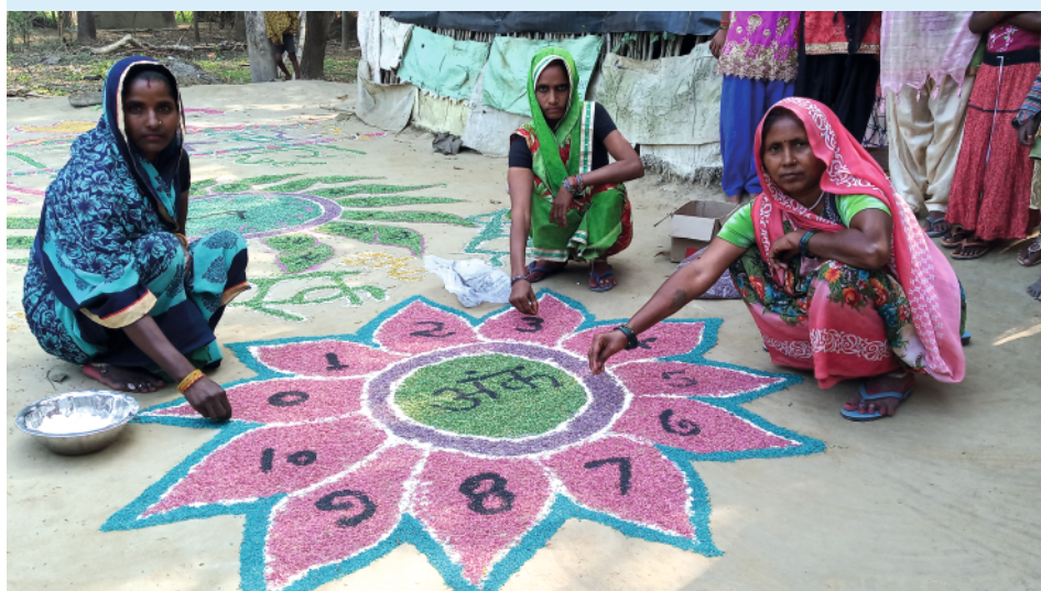
Rangolis made at SHIKSHA + Centre in Sarura Kala Village

At SHIKSHA + center of Gram Panchayat Sarura Kala village, on the batch closing day, learners expressed their gratitude towards SHIKSHA + through Rangolis. It was a delight to see these Rangolis as they showcased their learnings and awareness about COVID-19.