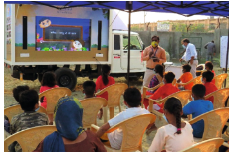
SHIKSHA Kiran classes being held

SHIKSHA Kiran is a part of the larger SHIKSHA Initiative, started by the Shiv Nadar Foundation in 2012 with a mission to create a literate and empowered India. Over the last nine years, SHIKSHA Initiative have worked towards improving the learning and retention outcomes among rural primary school students by leveraging Information Communication Technologies (ICT) and also bringing basic literacy programs to adults. And the efforts have shown visible results in 54,000 students in over 650 schools and train close to 1500 teachers in using ICT to make the pedagogy more effective and engaging. SHIKSHA Kiran is yet another effort in our overall mission and is especially critical given that there is an