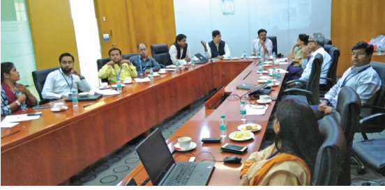
Brainstorming during Workshop

briefed about the SHIKSHA Initiative and SHIKSHA + program. A glimpse of the SHIKSHA + program and content was presented before the committee. Advisory committee appreciated the idea of making illiterate Adults literate and extended their thanks to Mr. Shiv Nadar for his vision and his efforts to take this forward in the form of SHIKSHA + program of SHIKSHA Initiative. Committee found the digital content more interactive and engaging.