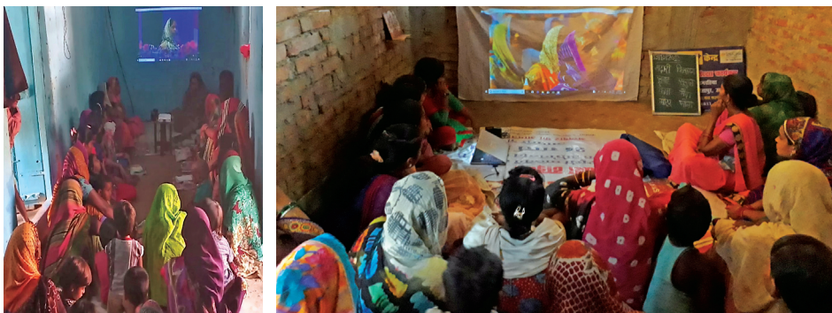
SHIKSHA+ learners actively participating in Rural Women day Celebrations