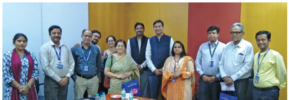
SHIKSHA Initiative and HCL Tech. EDGE Team with Advisory Committee Members