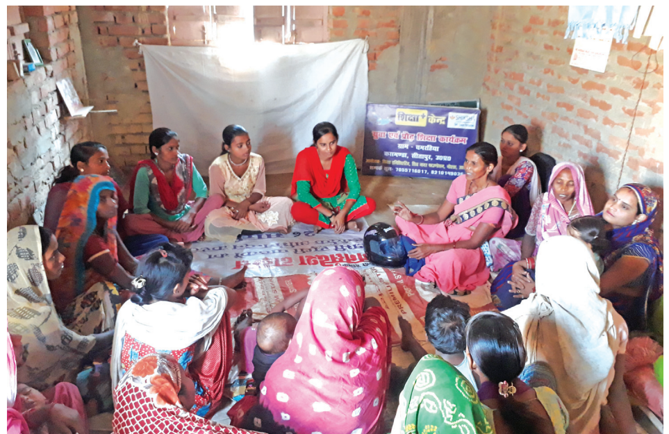
An Anganbadi Karyakarta sharing information at a SHIKSHA+ centre.

Most of the women are ignorant to hygiene during their menstruation cycle, eventually suffer with skin infection. Ignorance about healthy food habits is one of the major causes of anaemia in rural females. Realising the facts talks with 'Anganbadi Karyakarta' were organised at 10 SHIKSHA+ centres in Sitapur. Information for healthcare and hygiene was disseminated to the participants. Facilities in this regard catered by Panchayt PHC were also introduced. Talks concluded with the importance of literacy, health care and hygiene for woman to lead a healthy family.