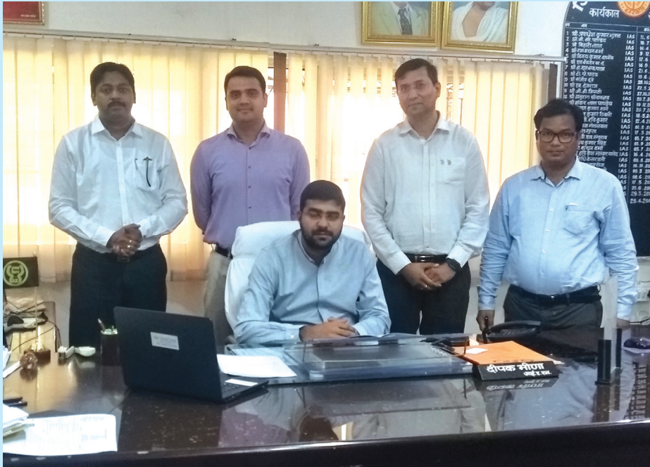
DM, Shravasti with SHIKSHA team at his office