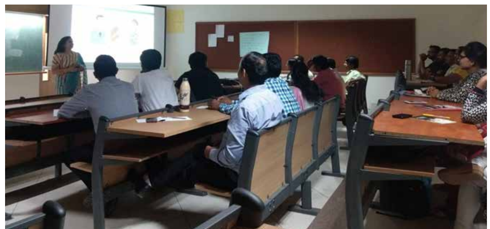
1 (Top) and 2(Bottom) SHIKSHA Initiative team at Kasmanda and SNU respectively attending training