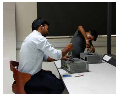
SHIKSHA Initiative IT Team in Action, Picture: Right of CoE tam and left photo is from Expansion