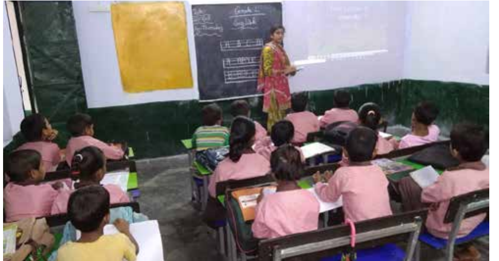
I.C.T. के माध्यम से पढ़ते बच्चे

छियासियान गढ़ी एक बहुत ही पिछड़ा हुआ क्षेत्र है। यहाँ बच्चों को पढ़ाना बहुत कठिन कार्य है। यहाँ बच्चों का विद्यालय में प्रतिदिन उपस्थिति नहीं हो पाती अतः वहाँ का वातावरण शिक्षा के क्षेत्र में बिल्कुल निम्न है। बच्चों को बुला कर लाना पड़ता है तथा बच्चों के माता पिता भी इस विषय में बहुत सक्रिय नहीं हैं। किन्तु हमारे प्रयास से बच्चे विद्यालय आने लगे हैं और उन्हें अच्छी शिक्षा भी प्राप्त होने लगी है। जब विद्यालय में I.C.T. के माध्यम से बच्चों को सिखाया जाता है, तो उनके अंदर पढ़ने में रुचि देखने को मिलती है। बच्चे कंटेक देखकर जल्दी सीखने की कोशिश करते हैं तथा वे प्रतिदिन विद्यालय में आने की कोशिश करते हैं। उनके माता-पिता भी कभी-कभी बच्चों को देखने विद्यालय आते रहते हैं। वे अपने बच्चों को पढ़ते देखकर अत्याधिक प्रसन्नता व्यक्त करते हैं। अतः अब यहां पर लोगों को शिक्षा की