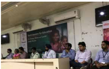
Panel discussion on 'Potential Collaboration on Education'

P HIA Foundation and Vigyan Foundation in collaboration with the UNICEF, Change Alliance, Sarva Shiksha Abhiyan (SSA), Department of Basic Education, FICCI-Flo organized a brief session with the objective for ensuring inclusive and equitable quality education as 'Torch-bearers for Education.' The session was organized on June 27, 2018 at SCERT Hall, Nishatganj, Lucknow. During the session, CCRD (Centre for Community and