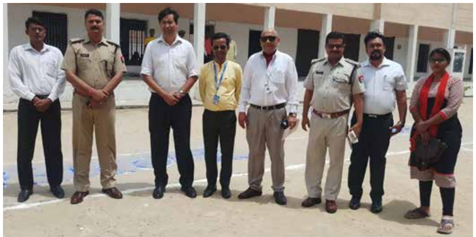
SHIKSHA Initiative team members with jail authorities

Considering the fact, SHIKSHA Initiative is working to address it through its profound intervention among the Adult illiterate through its SHIKSHA+ program. In view of the above, SHIKSHA+ expanded its operation in District Jail Gautam Buddha Nagar, on the request of Superintendent of Jail. A letter of intent