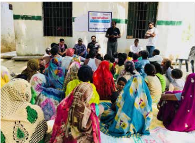
SHIKSHA Initiative team members organizing village meeting

SHIKSHA Initiative participated actively in “School Chalo Abhiyan” of Sarva Shiksha Abhiyan, to generate awareness for enrolling in schools. Drivelasted for five days and community mobilization activity (May 7-11,2018) was carried out in villages of Kasmanda block, Sitapur (U.P). School and community are the most important stakeholder for a child’s education and their aligned, active participation can help to change the scenario of a child’s education.