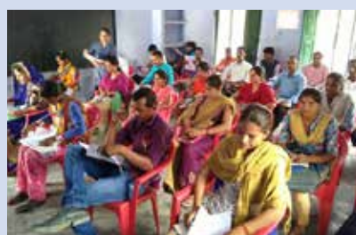
Volunteers appearing for written test for the position of 'Janshikshak' at Gram panchayat level

Every village of targeted Village Panchayat was visited and screened to identify well deserving and result oriented candidates. It's was a challenging task to convince masses to volunteer and appear for selection process, especially when candidates are from rural background