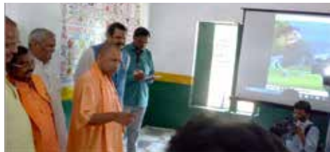
Chief Minister, Uttar Pradesh - Yogi Adityanath observing SHIKSHA Initiative Smart Class.