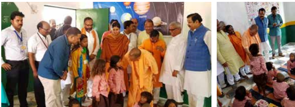
Chief Minister, Uttar Pradesh - Yogi Adityanath Interacting with Students in SHIKSHA smart class

District administration has collaborated with Shiv Nadar Foundation, UNICEF, Panchayat, NEDA, District Mineral Foundation Trust, Sonbhadra, Piramal Foundation to uplift the education level in the district schools. District Mineral Foundation Trust has provided fund for laptop and projector, as it was a great challenge for village Panchayats. Patwadh-I, ICT enabled Primary School will be a model for the remaining 99 schools shortlisted for 'Sone School Kayakalp Initiative'. ■