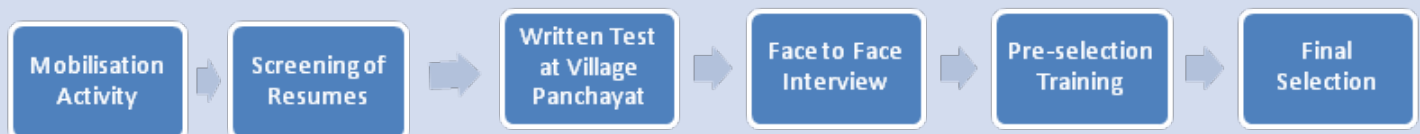
Recruitment and Selection Process of 'Janshikshak'

2018-19, academic year is remarkable for SHIKSHA plus program by witnessing an expansion to reach around 7000 adult illiterates in the district of Sitapur and Gautam Buddha Nagar.