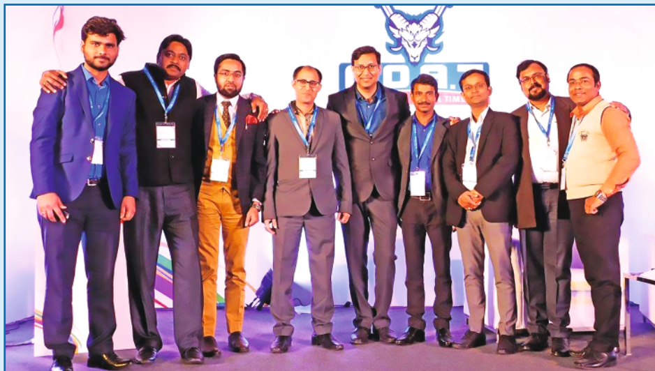
SHIKSHA Initiative Team in Shiv Nadar Foundation Leadership Conclave 2018