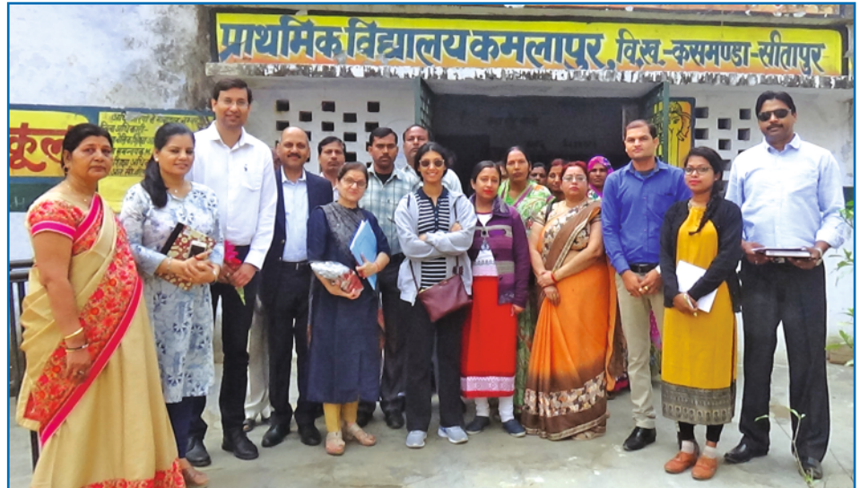
Roshni Nadar Malhotra with School Principal, Teachers and SHIKSHA Initiative Team Members at Primary School, Kamlapur

Roshni Nadar Malhotra, a Trustee of the Shiv Nadar Foundation visited government primary schools (P.S.), namely P.S. Kamlapur, P.S. Kasmanda I and SHIKSHA+ Centre of village Narayanpur on February 28, 2018, wherein ICT enabled education has been introduced by SHIKSHA Initiative. While interacting with the school principal and teachers, Roshni laid emphasis on the importance of teacher's training and their regularity. She also got the opportunity to interact with some of the parents who shared that how ICT classes have made their life easy, as now their children themselves