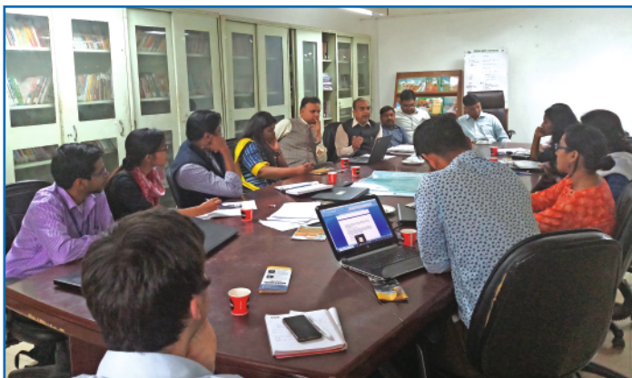
Meeting with SCERT and Development Partners

locations of the development partners, to study the education status of schools in respect to learning outcome of Grade I and II.