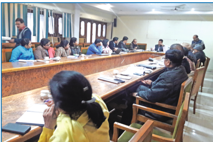
Meeting of SCERT and Development Partners with DoBE