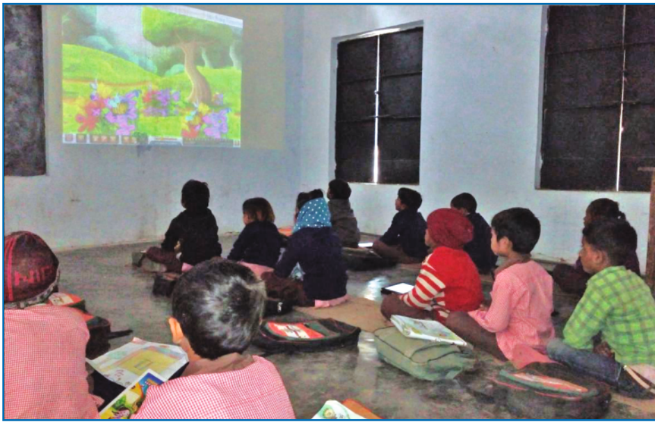
SHIKSHA Initiative ICT Class

हूँ – अरे सारे गाँव के मुर्गा यहीं आ गए क्या? बच्चे हँसते हैं। उनसे शेर की आवाज निकालने के लिए कहता हूँ। जब बच्चे शेर की आवाज निकालते हैं और मैं उरकर गिरने का अभिनय करता हूँ, तो सारे बच्चे खिलखिलाकर हँस पड़ते हैं। इस बात – चीत में मैं उनकी भाषा बोलने का प्रयास करता हूँ तािक मैं उनकी कल्पनाशिक्त के पंख लगाने के लिए और हिन्दी शब्दों को सिखाने के लिए और हिन्दी शब्दों को सिखाने के लिए Content (CMS) चलाकर किवताओं के माध्यम से शब्दों का उच्चारण करवाकर खेल-खेल में भाषा से जुड़ाव करने का प्रयास करता हूँ।"