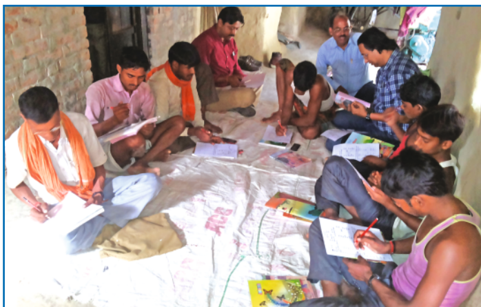
SHIKSHA Initiative Project Director and Team with SHIKSHA + Learners