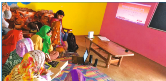
Technology- Mediated Learning