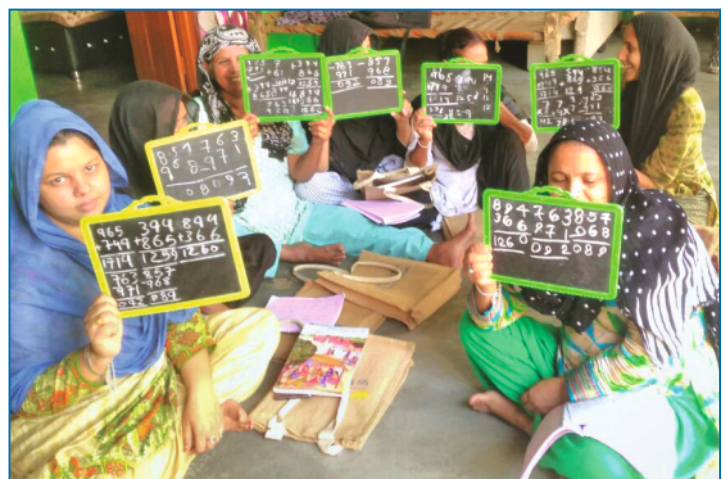
SHIKSHA + Learners, Batch 5, Chhauas Centre